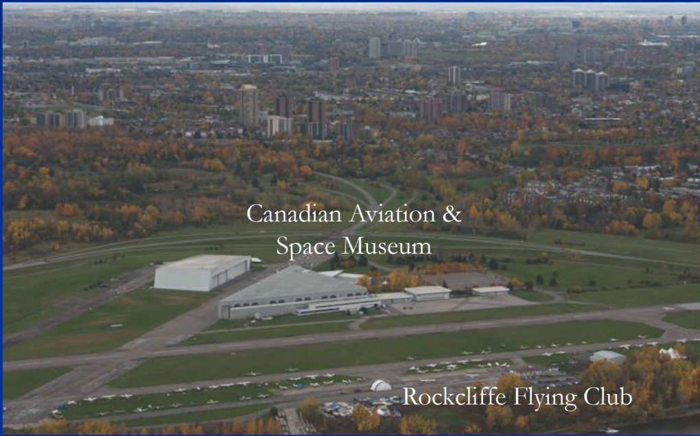
Canadian Aviation & Space Museum