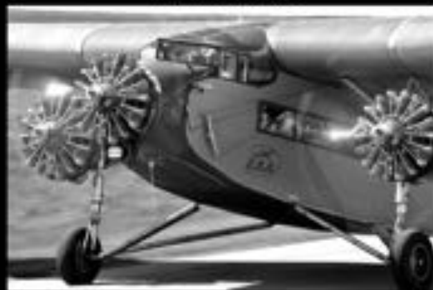
TriMotor @ Gow 2019