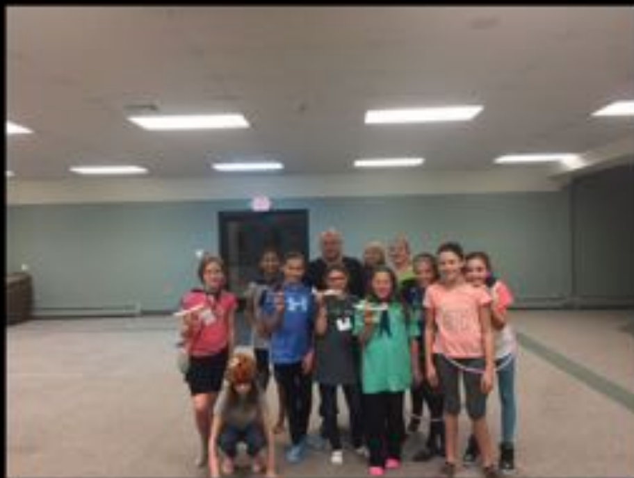
How airplanes fly - an educational program at a local church group!