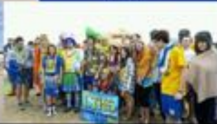
Lyons Township Aviation Club!