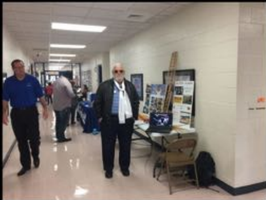
Meadow Glens Elementary School