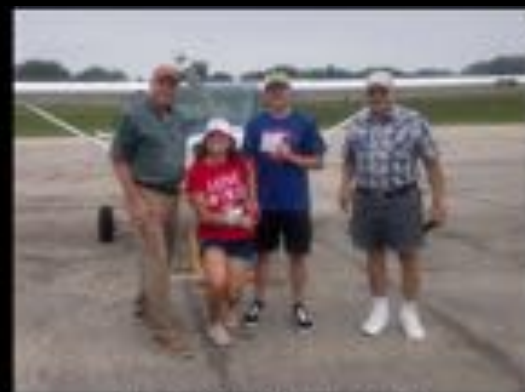
Chapter 15's Ray Aviation Scholar!