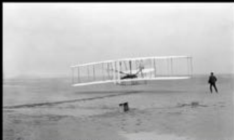
First heavier than air flight - Wright Brothers - December 17 th , 1903

The best way to predict the future is to invent it. -Alan Kay