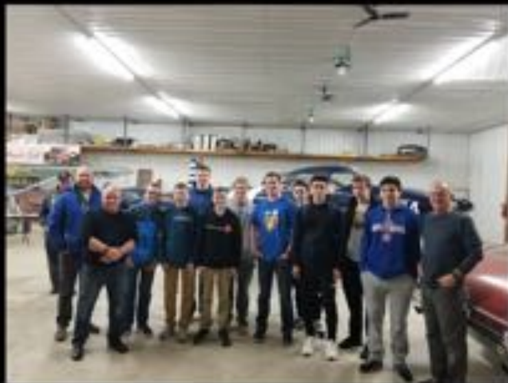
Lyons Township Airport day!