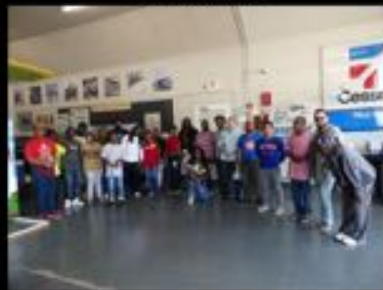
Special Needs Adults